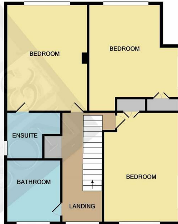
1ST FLOOR APPROX. FLOOR AREA 799 SQ.FT. (74.2 SQ.M.)

TOTAL APPROX. FLOOR AREA 1775 SQ.FT. (164.9 SQ.M.)