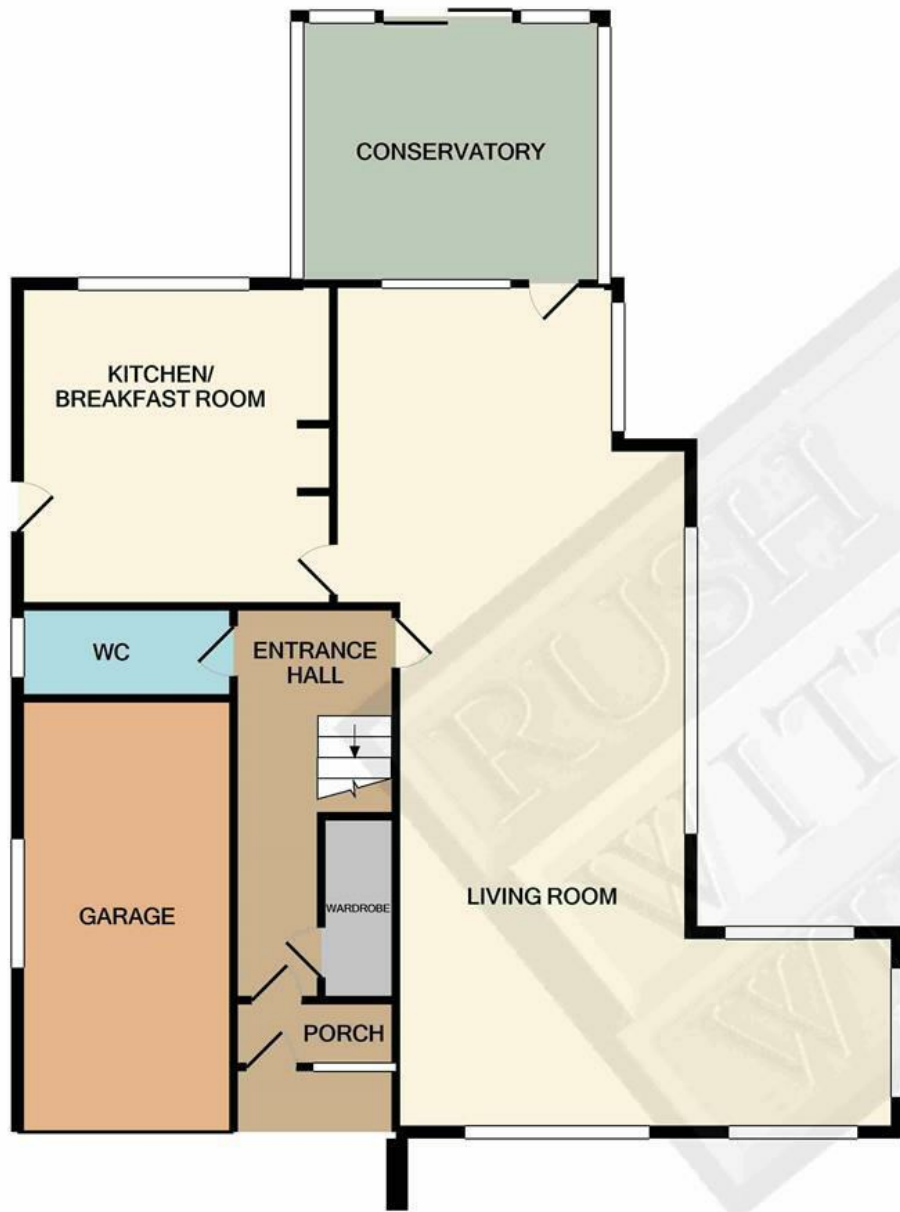
GROUND FLOOR APPROX. FLOOR AREA 976 SQ.FT. (90.7 SQ.M.)